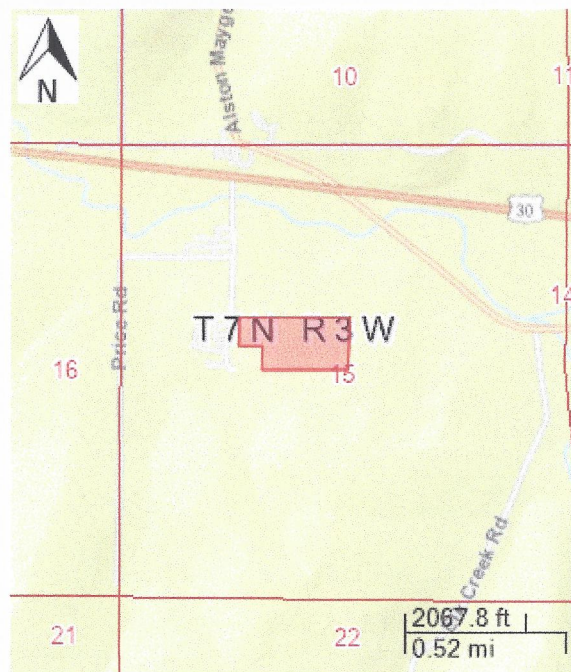
Unit Map: price rd wind damage