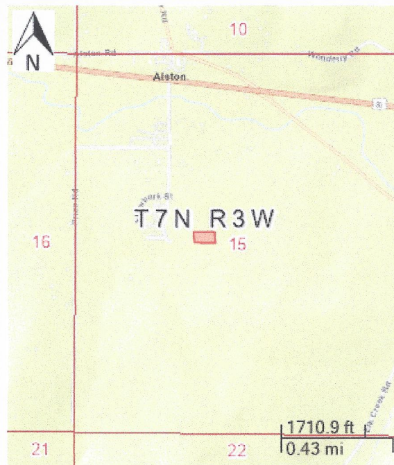
Unit Map: CC 2021